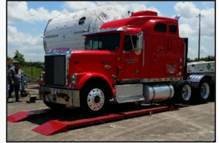
INSTALLED AT NASA, MAY 2015