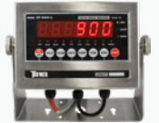
OP-900 STAINLESS STEEL