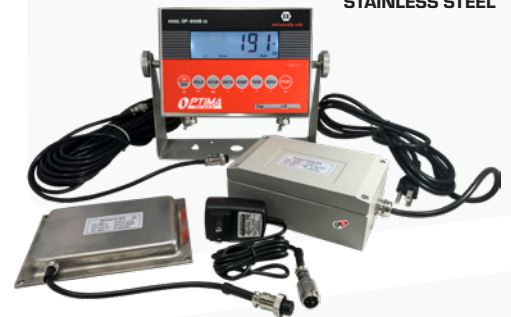
INTRINSICALLY SAFE OPTION