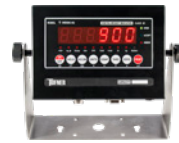
OP-900 PAINTED STEEL