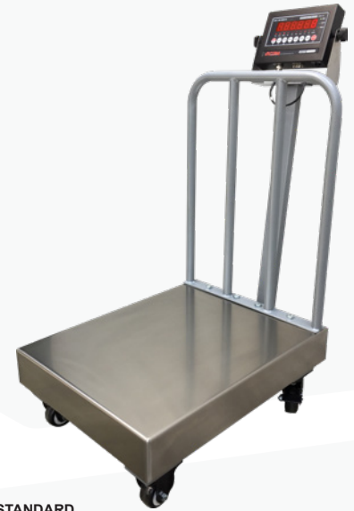
STANDARD WITH SS COVER