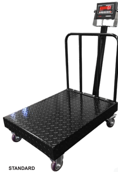
STANDARD DIAMOND PLATE