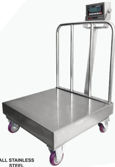
ALL STAINLESS STEEL