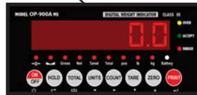
Easy to use OP-900 indicator with 0.9" LED display