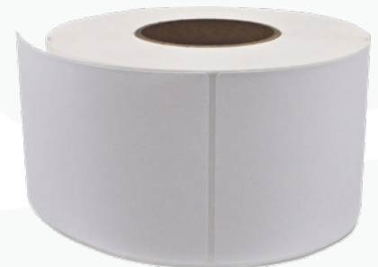
4" X 6" LABELS